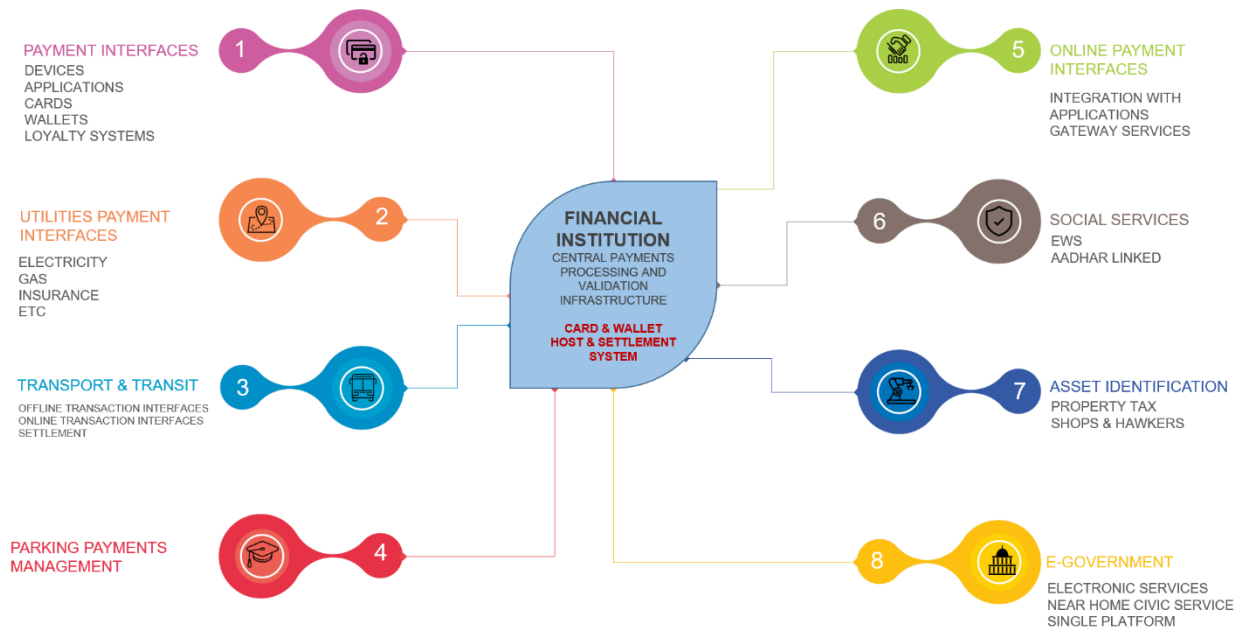
Figure 1: Conceptual CPC Architecture

The integrated framework of CPCS shall enable seamless payments and services to be delivered over the service network built for services and payments needs. The framework presented below shall offer you a bird’s eye view of the intended common payment card network to be deployed as part of this project. The system being proposed will act as a city foundation framework for integrating objectives of implementing common payments infrastructure and will play pivotal role in digital payments proliferation within Bhubaneswar city. The CPCS is proposed to be utilized by current PT System and any other future public transit system that may be implemented within Bhubaneswar City and other payment services required by BMC as already mentioned in this document. The system will offer independence of payment options to match all the stakeholder’s requirements and also aim at delivering near home services as part of larger governance transformation process. The service delivery points will act as near home payments and city service hub and will enable citizens to pay for virtually all kind of payment needs within a household. The proposed system shall be enabled for integration with AADHAR system of UIDAI.